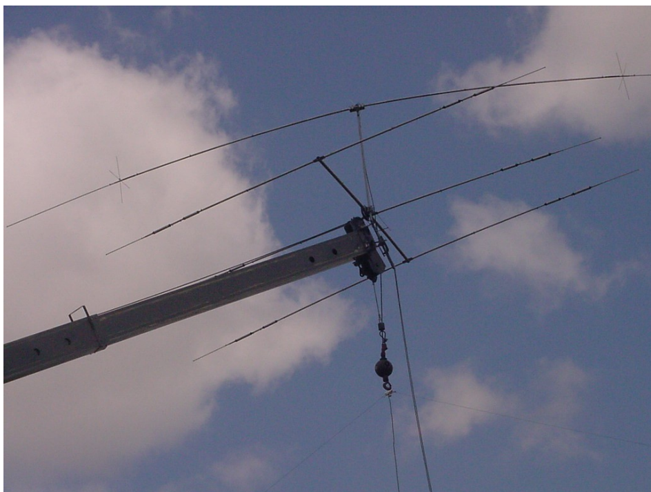
80 – 10 meters on one support!