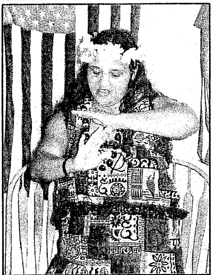
Aloha performed several hula dances for the groups pleasure.