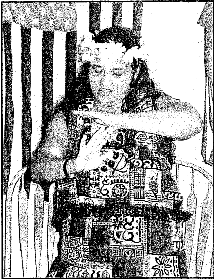
Aloha performed several hula dances for the groups pleasure.