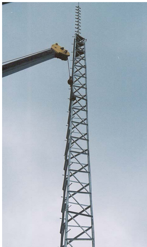
Closeup view of one of Lloyd's towers being lifted by the crane