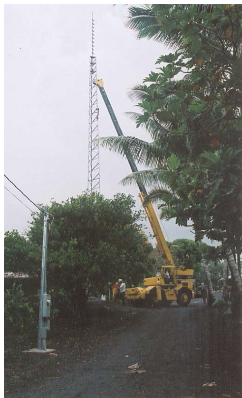
One of the towers being lifted into position by the crane