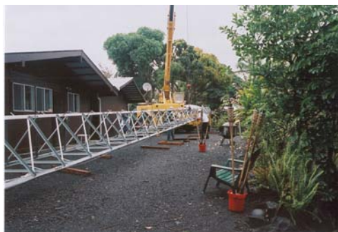
One of Lloyd Cabral's (KH6LC) two new towers ready to be put up