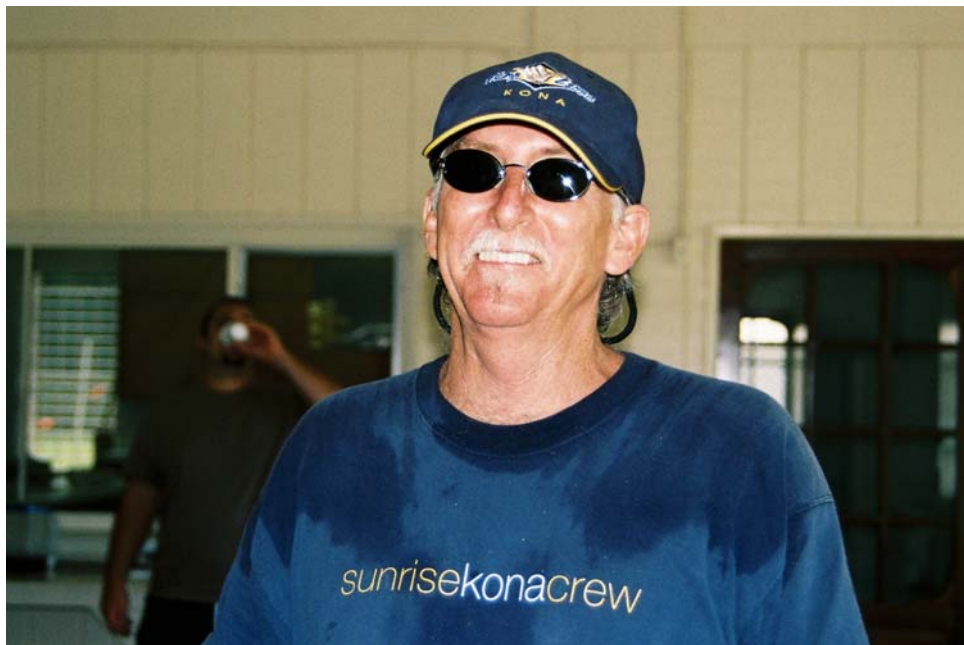
STU KH7DX (Kona ham)