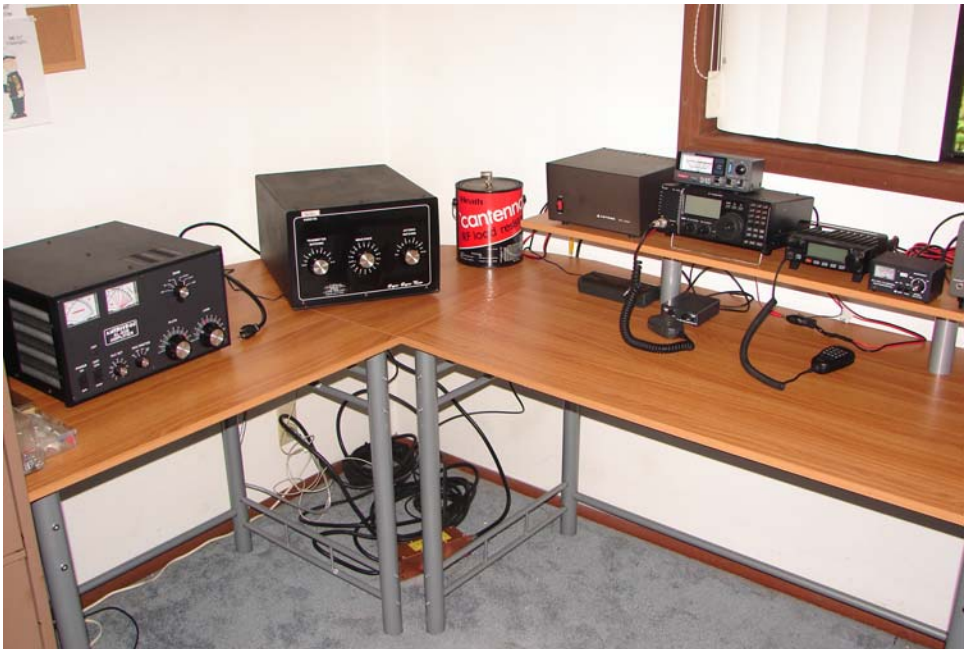
Larry Sell's AH6SK ham station