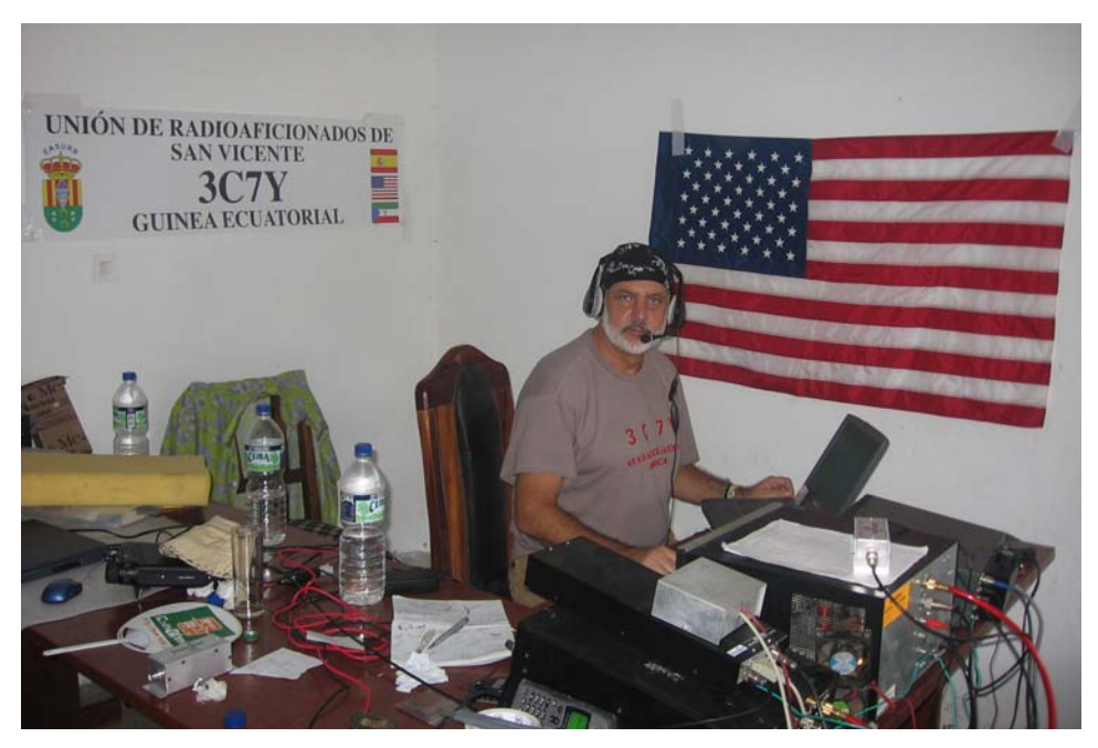
Elmo - SSB