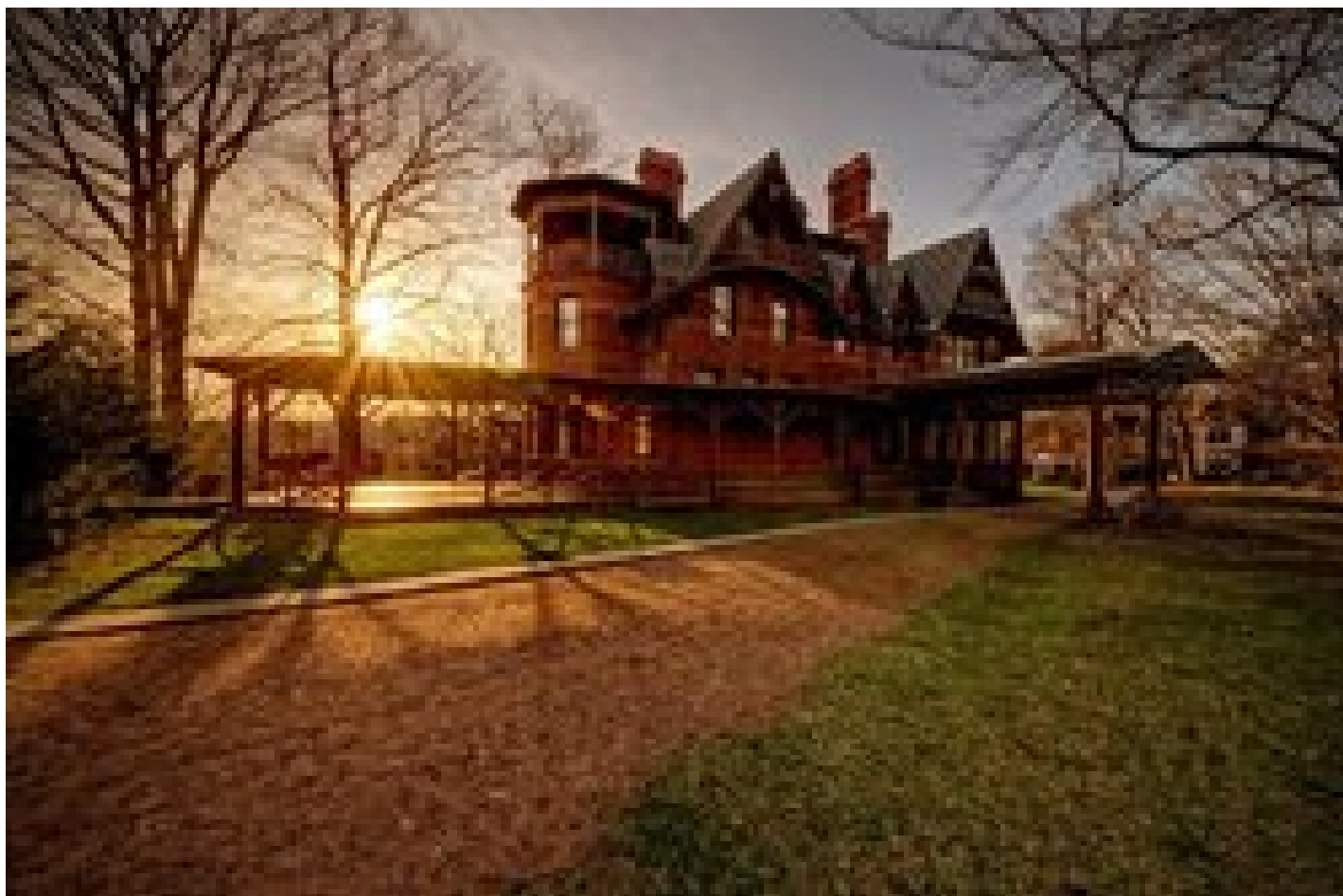
The Mark Twain House and Museum in Hartford, Connecticut.