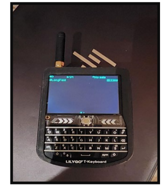
Pictured: the LILYGO T-DECK.