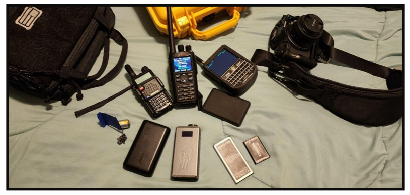
Pictured: lithium ion batteries and some of the projects that are getting new life from old junk.

I also managed to get my Meshtastic network started and will be using some of the